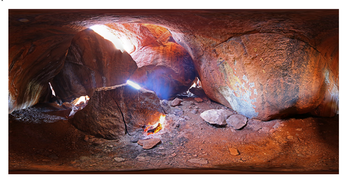
An example of how the above can be experienced can be found here: http://paulbourke.net/fun/Ngintaka/pano12.html

http://paulbourke.net/exhibition/Wanmanna/