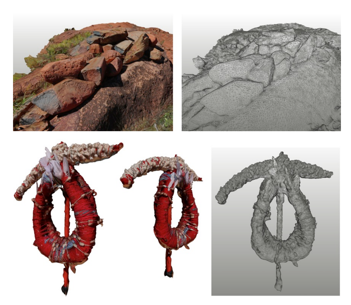
Examples of one possible pipeline here: http://paulbourke.net/miscellaneous/reconstructionphoto/ Further discussion here on accuracy: http://paulbourke.net/miscellaneous/reconaccuracy/