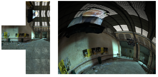
Figure 3. Four cubic maps (left) and warped image (right) for projection onto a hemispherical dome after reflection from a spherical mirror.

The software model for capturing the cubic faces is often referred to as the multipass texture capture. The virtual camera of the game is modified such that it has a 90 degree vertical and horizontal field of view. The scene is rendered up to 6 times, each render has the camera pointing in a different direction, namely towards the center of each face of the unit cube. On each render instead of displaying the image to the user the image is copied to a texture for later use. At the end of these passes all the textures are applied to a mesh which is then rendered and displayed, typically using an orthogonal camera model. There is clearly a performance penalty in rendering the scene a number of times and then performing the final textured mesh render. The final rendering phase has very little affect on the performance using today's graphical hardware and is independent of the scene complexity. The multipass rendering performance is proportional to the scene complexity but there are generally efficiencies that mean the performance factor is less than the number of rendered views.