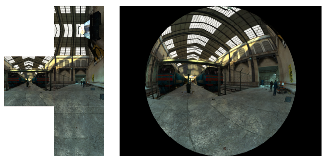
Figure 2. Four cubic maps (left) are required to reconstruct a fisheye (right) for a hemispherical display.

For immersive environments a more useful image format are cubic maps, that is, the six 90 degree perspective projections from the current camera position to each face of a unit cube centered on the camera. This is not a new idea for games or virtual reality applications since cubic maps are often used to create high quality backgrounds or environmental lighting [11]. If all 6 cubic maps are available then the entire visual field is defined and therefore any immersive projection can potentially be formed. For most immersive displays not all 6 cubic faces are required, for example in figure 2 it can be seen that only 4 are required to create the fisheye that would fill a hemispherical dome surface. If the fisheye image in figure 2 were projected through a fisheye lens located near the center of a hemispherical dome them the result on the dome surface would look undistorted to a viewer also located near the center of the dome.