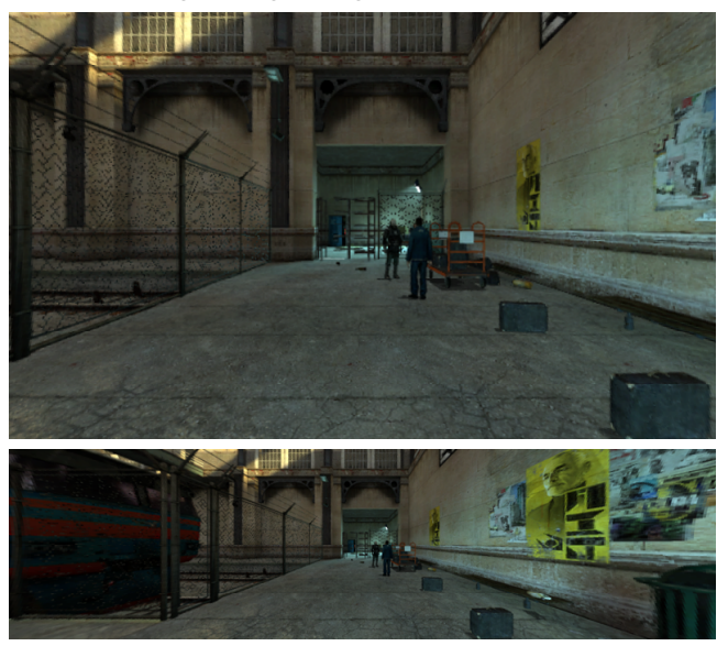
Figure 1. 100 degree (top) and 140 degree (lower) horizontal field of view using a perspective projection.

Here I propose an alternative single projector based projection system for immersive gaming and other virtual reality applications. It solves the optical problem by using a spherical mirror to scatter light across a wide field of view [3]. The distortion that would normally result when reflecting a computer generated image off a spherical mirror is corrected for in software with minimal processing overhead thanks to the power of today's graphics hardware. While there are some advantages projecting onto smoothly changing surfaces such as cylinders and domes, the approach can also be used to project onto almost any (concave) surface including existing rectangular rooms.