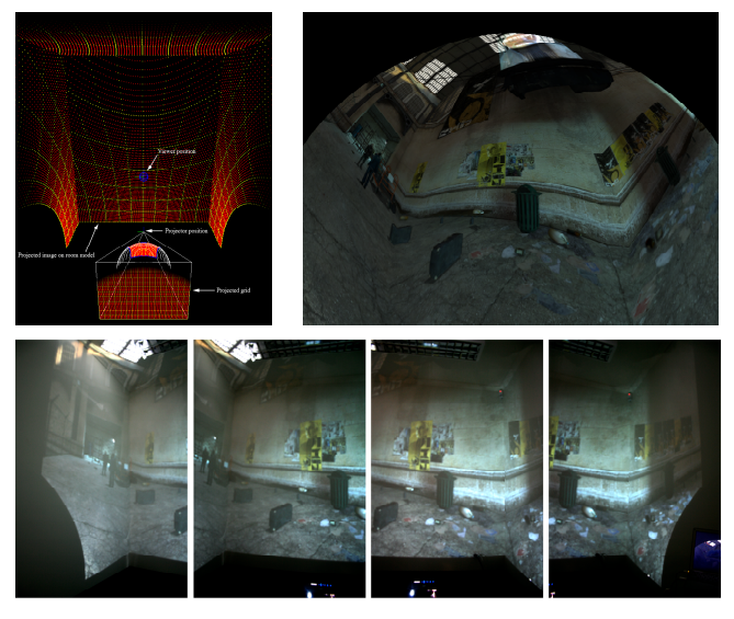
Figure 7. Optical simulation using raycasting into an accurate room model, top/left. Projected image that results in an undistorted view, top/right. Photographs of the actual room in 4 segments, note the camera is located further back from the ideal viewing position.

The approach discussed is based upon single projectors for reasons of cost and simplicity, this does however limit the resolution of the projected display. This resolution limit is another feature of the human visual system that is not fully utilized on most projected displays. Fortunately SXGA+ (1400x1050 pixel) resolution is now available at commodity prices, unfortunately there don't seem to be higher resolution commodity products on the near horizon.